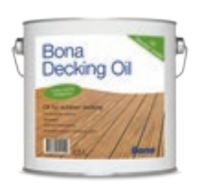
Available in 2.5 Lt Neutral only